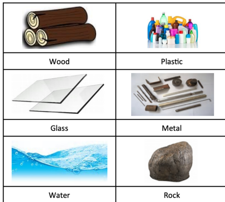
Diagram and symbols